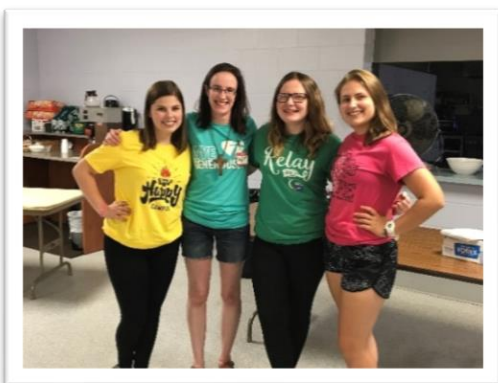
Stoney Lake Camp Counselors

Have a very blessed month and thank you for sharing your child(ren) with us at Immanuel!