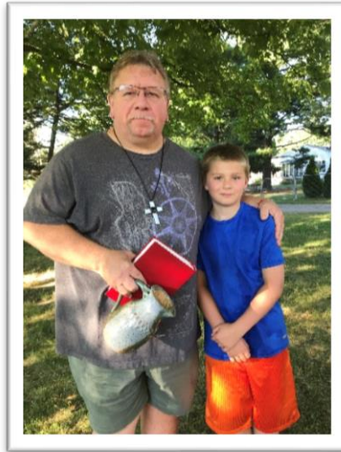
Adventure Camp Evening Baptism