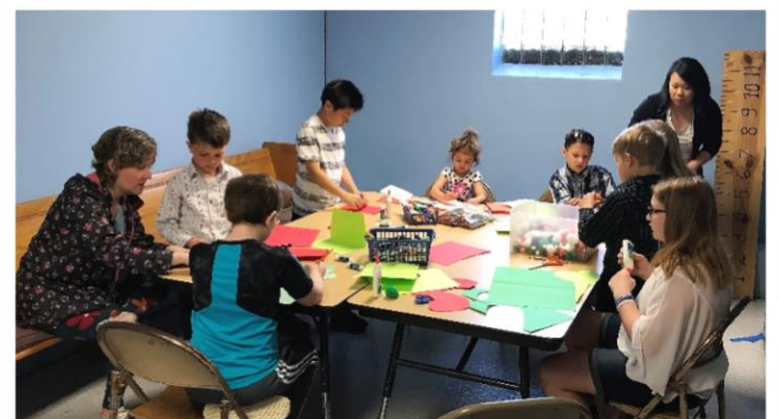
Christ Connections creating cards for First Responders